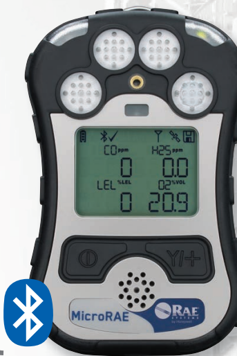
MicroRAE talks via Bluetooth® Low Energy (BLE) technology to the phone

Already have a private Wi-Fi or mesh network? Use BLE and Safety Communicator to ensure continuous wireless monitoring even when a worker is out of range. With the MicroRAE and real-time monitoring software, you never have to worry about blind spots. You always have visibility on your workers' location and gas status.