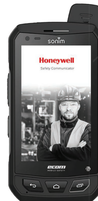
Phone talks over cellular network to the same host PC as the other detectors